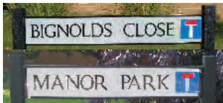
The new street signs in place

The look of roads in the village has changed in the last couple of months as new street signs and road surfaces have appeared.