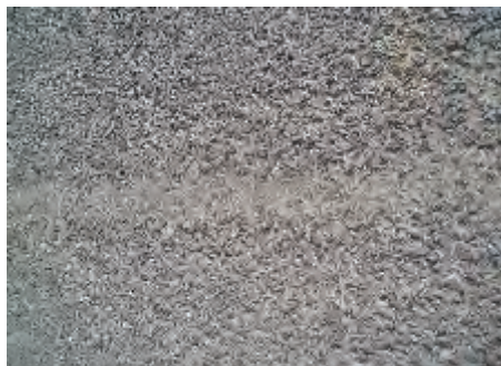
The new surface on Mollington Road is already showing signs of wear