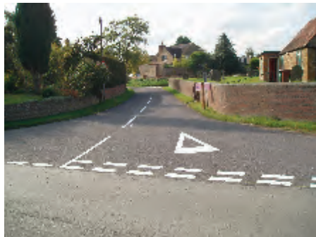
Resurfaced and relined, Mollington Rd at the junction with Main Street